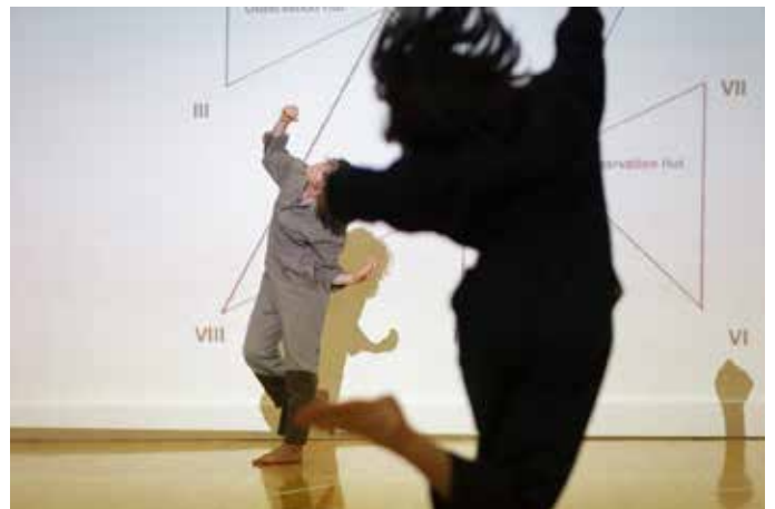
The Nine Returns to the One , The Place, London, UK (2018)