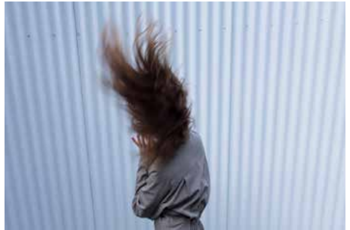
dreiküchenhaus | labour, ritual, and civilization , Hidden Lines of Space: Our House , Hamburg, DE (2018)