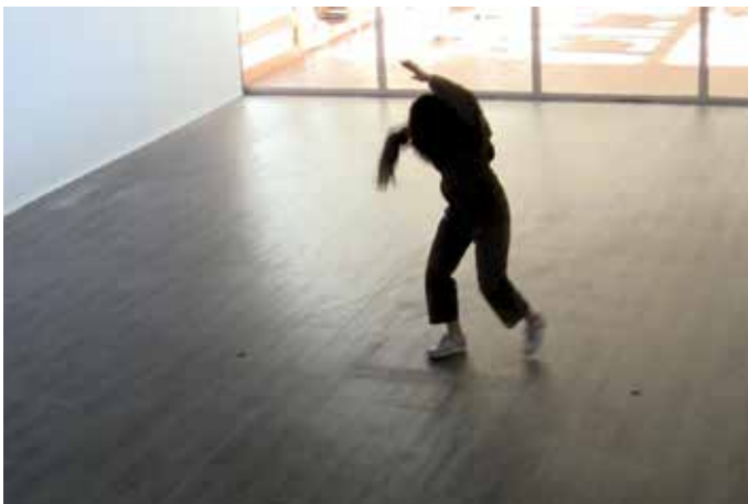
The Nine Returns to the One , Kunstmuseet Nord-Torondelag, Namsos, NL (2018)