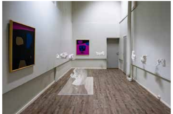
Meaningless Gestures , «I hear you» ( Jeg hører deg ), Kunstmuseet Nord-Trøndelag, Namsos, NL (2018)